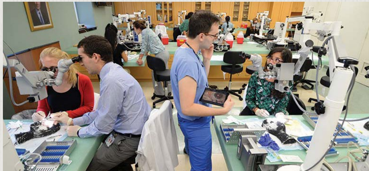
The Jorge N. Buxton, MD, Microsurgical Education Center today.

stricted operative areas located deep within the temporal bone of the head, involving sensitive bones and delicate tissues responsible for hearing and balance, and the nasal sinuses. Additionally, reconstructive and aesthetic surgeons access the center’s resources to practice the newest laser skin resurfacing methods and to train in an array of endoscopic techniques that have been introduced over the last decade.